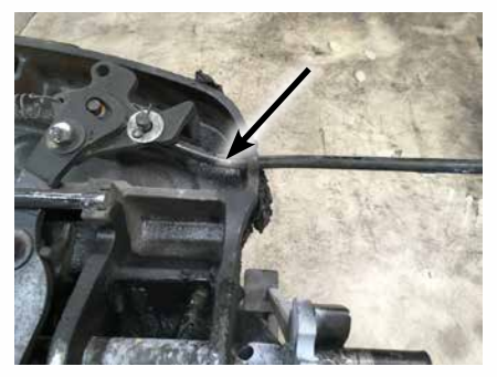
The above bent handle is no longer usable and must be replaced.

Never try to straighten a bent or broken pull handle. Replace with kits shown below.